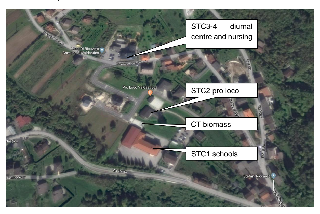
Figure 1. Satellite view of Valdastico district with highlights on the interested buildings

The Municipality of Valdastico is located in the Province of Vicenza, in the north east of Italy, and it represents a typical small community of mountain area (1,300 inhabitants at 405 m above sea level).