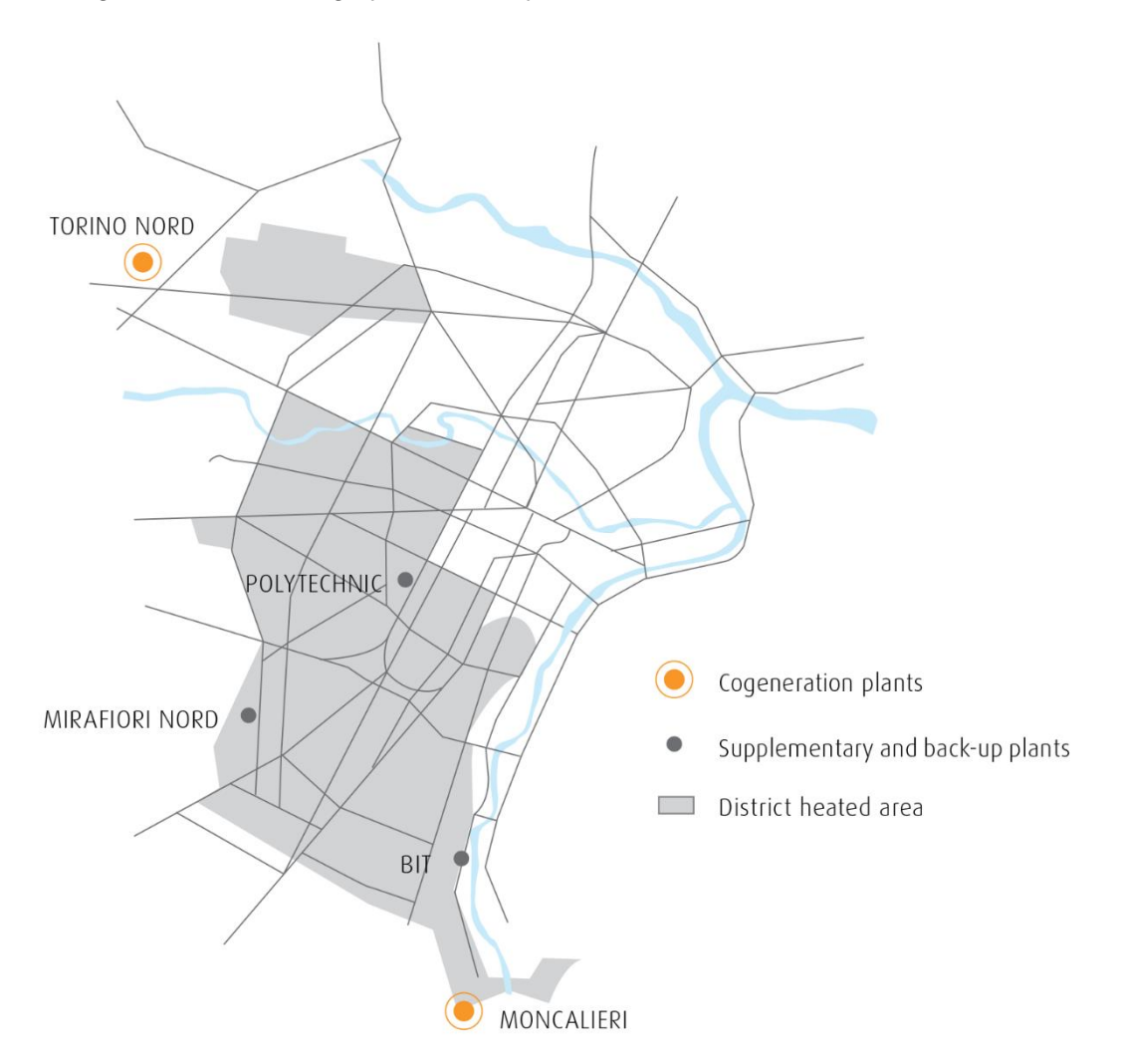
Figure 1. Schema of Turin District Heating Network, showing the two main stations and the supplementary substations for the heated area

The system is capable of heating a volume of 60 Mm<sup>3</sup> , covering the 55% of heat demand in the buildings of Turin through a complex network of over 500 km, making Turin the city with the largest district heating system in Italy.